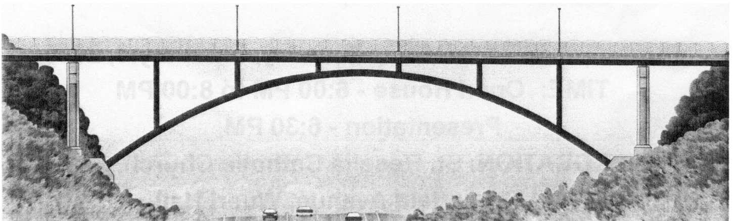
New Bridge - Beechwood Boulevard Bridge, 2017