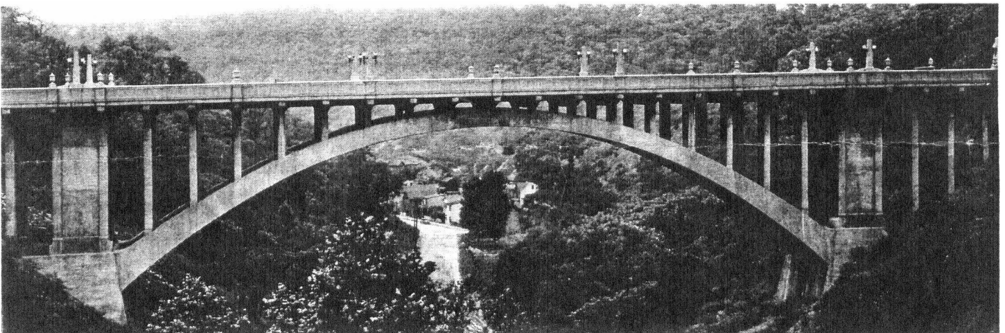
Current Bridge - Beechwood Blvd. (a.k.a. Greenfield) Bridge, 1923